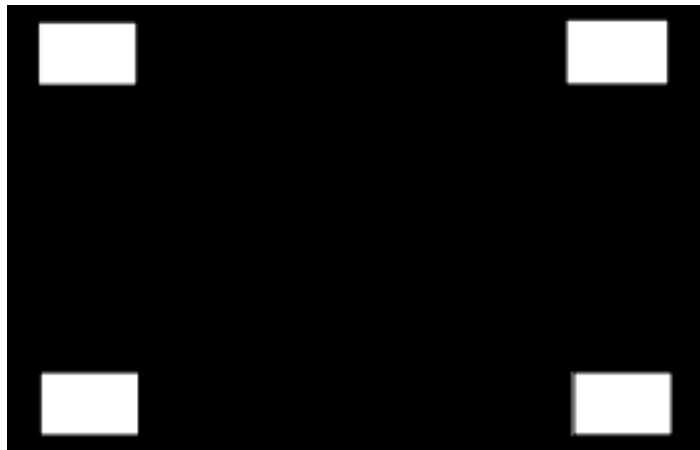
Figure 3- Schematic diagram of 2.5% corner white window signal