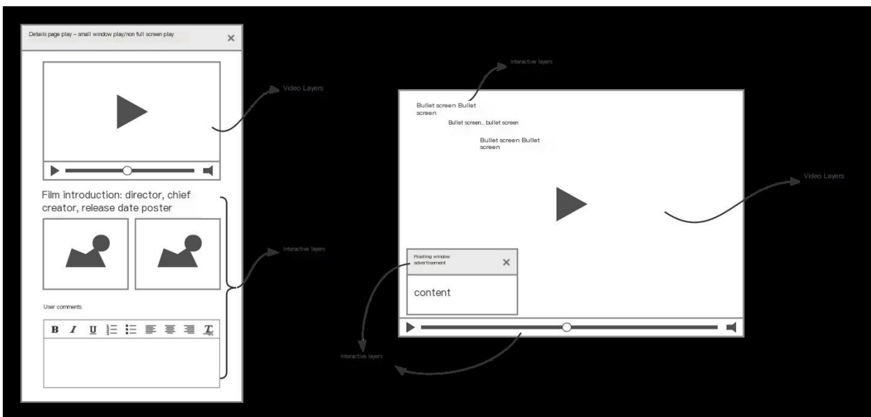
Figure 1 Schematic diagram of relationship between video layer and interaction layer in user application software